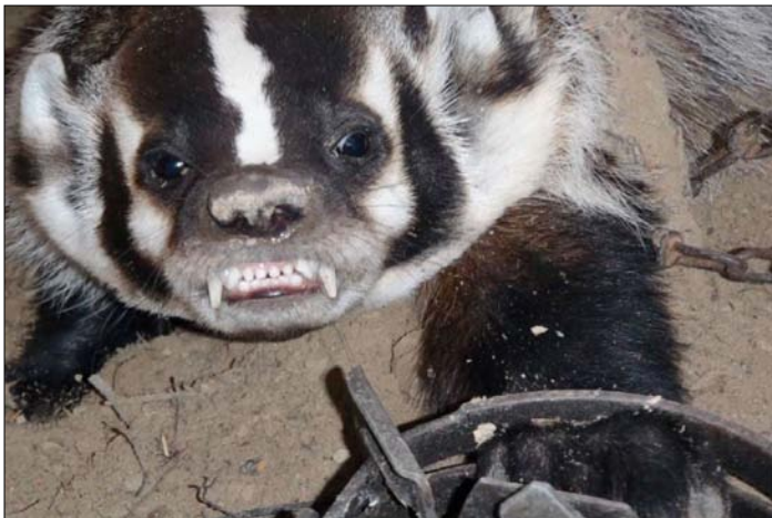
Nearly trapped to extinction in the past, the badger has rebounded in some parts of the West. State population data is lacking, however.

Environmentally harmful chemicals including chromium and formaldehyde are used in the processing and tanning of fur garments to prevent them from decomposing. The Industrial Pollution Projection System rates the fur dressing and dyeing industry as one of the five worst industries for toxic metal pollution. In 1991, six New Jersey fur processors/tanners were fined more than 2 million dollars for releasing toxic waste into the environment. Tanneries more than any other business are on the Environmental Protection Agency's Superfund list that identifies priority environmental contamination sites.