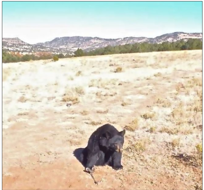
Many states do not permit bear trapping, but this black bear was incidentally trapped in New Mexico.

Prohibiting the use of indiscriminate traps will balance management with the expectations of the majority of the public and will help ensure public safety. It will also protect individuals from enduring the emotional and financial strain of dealing with the loss or injury of their companion animals to the jaws of a trap.