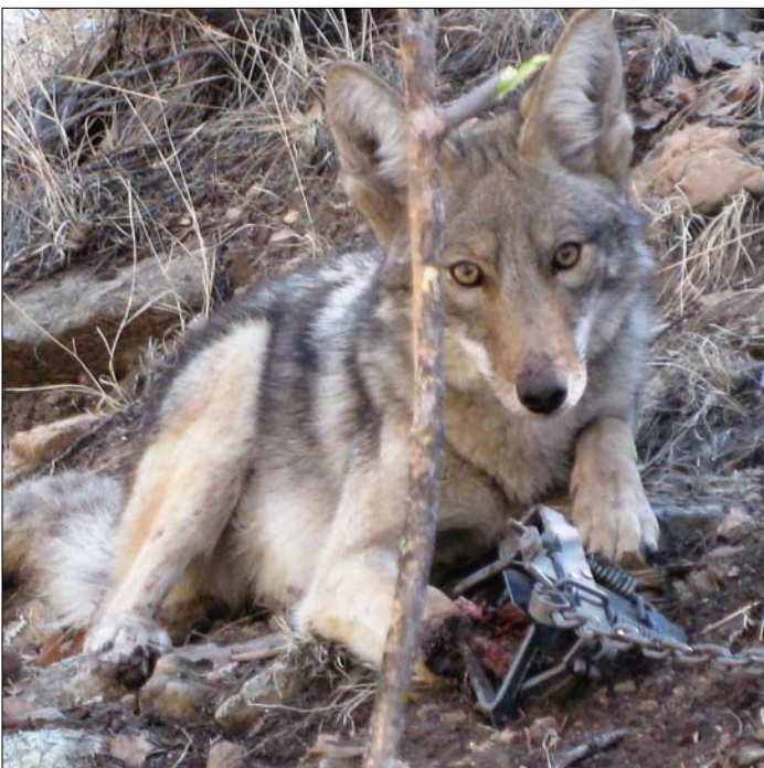
Trapped animals fight for their freedom and many sustain catastrophic injuries while ensnared.

Animal traps fall under two categories: restraining or killing. Restraining traps hold the animal until the trapper arrives to kill it. Kill traps are designed to cause immediate death and are used either terrestrially or underwater. The terrestrial traps snap the neck or